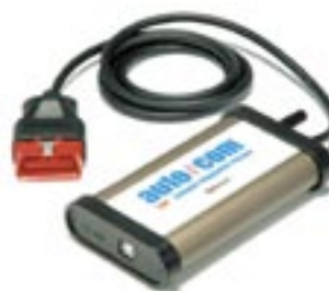
CDP, Compact Diagnostic Partner, is a userfriendly Bluetooth based tool for car-specific diagnostics.